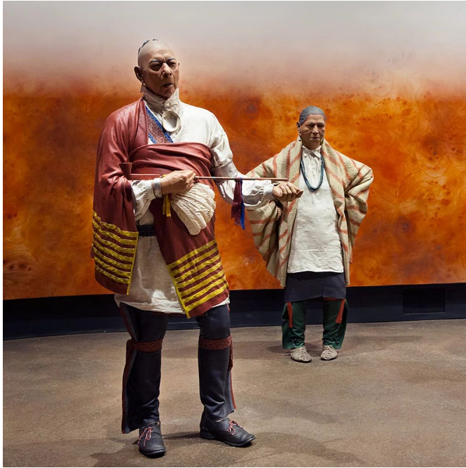
Oneida Indian Nation wax figures

The Oneida Indian Nation gallery highlights the role Native Americans played in the Revolutionary War, as part of M*AR's mission to tell diverse stories often omitted from history textbooks.