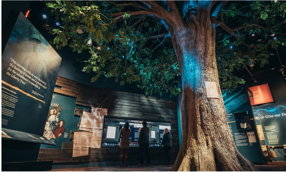
18-foot replica of America's first Liberty Tree

Liberty Trees were the early meeting-places for colonists planning their revolt against the British Empire.