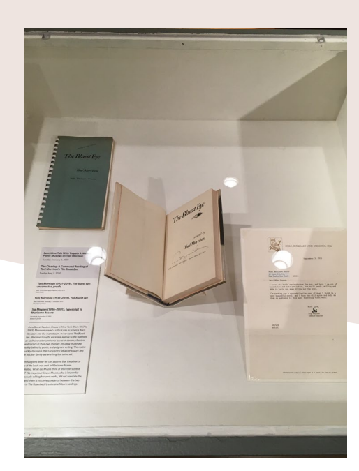
Toni Morrison's The Bluest Eye

MINI-EXHIBIT I HELPED INSTALL (FOR THE SPRING PROGRAMS)